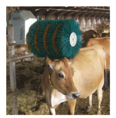
The horizontal design of the E-Brush en. brushing where it is most needed: on the cow's back, tail and head. The pendulum design ensures optimum counter pressu and effectiveness. It does not roll freely over back or flank ana egisc tivaness. it acoes not rost presely over to acci or jiani, without bru shing. Rapid automatic start/stop. The brush design with long and short bristles creates a better brushing effect on individual cows.