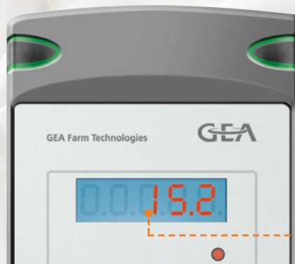
5-digit LED display

Metatron P21 and Metatron S21 can be combined with each other: you can install the Metatron P21 with its integrated gate control e.g. at the first and last milking stall and equip all the remaining stalls with Metatron S21.