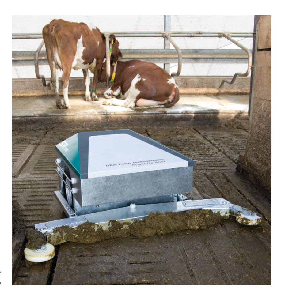
Over 500 kg dead weight ensure a secure grip

The slat robot from GEA Farm Technologies is the ideal technology for cleaning both main and connecting passageways, and in particular for completely cleaninig barn corners and edges.