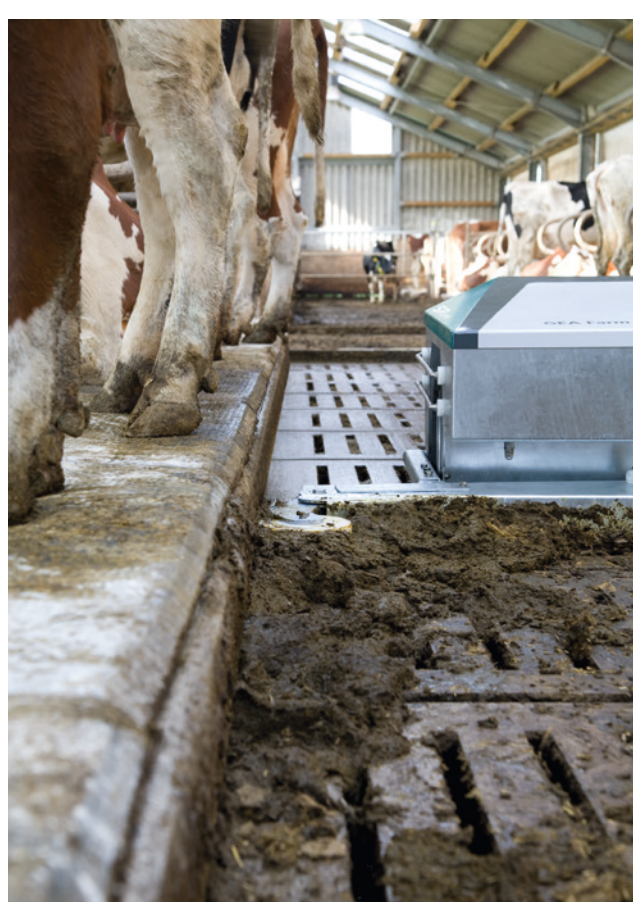
Clean paths mean fewer pathogens

Calm atmosphere in all areas of the barn The SRone moves noiselessly between the animals without causing any agitation. Quite the opposite, the cows take to it right from the start. Flat and compact, the SR one moves smoothly under gates and carries out its work without supervision. The safety switch is particularly animal-friendly; as soon as the pushing is exceeded, it stops forward movement and starts an obstacle-avoidance manoeuvre.