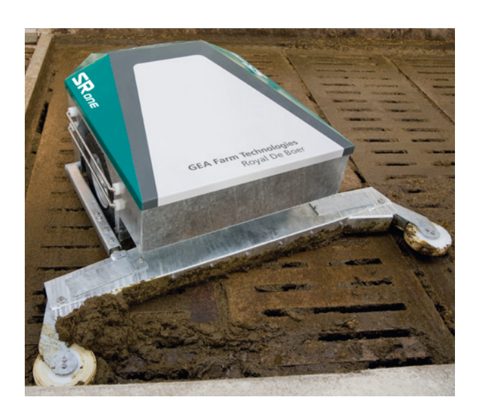
Agile even in the smallest space