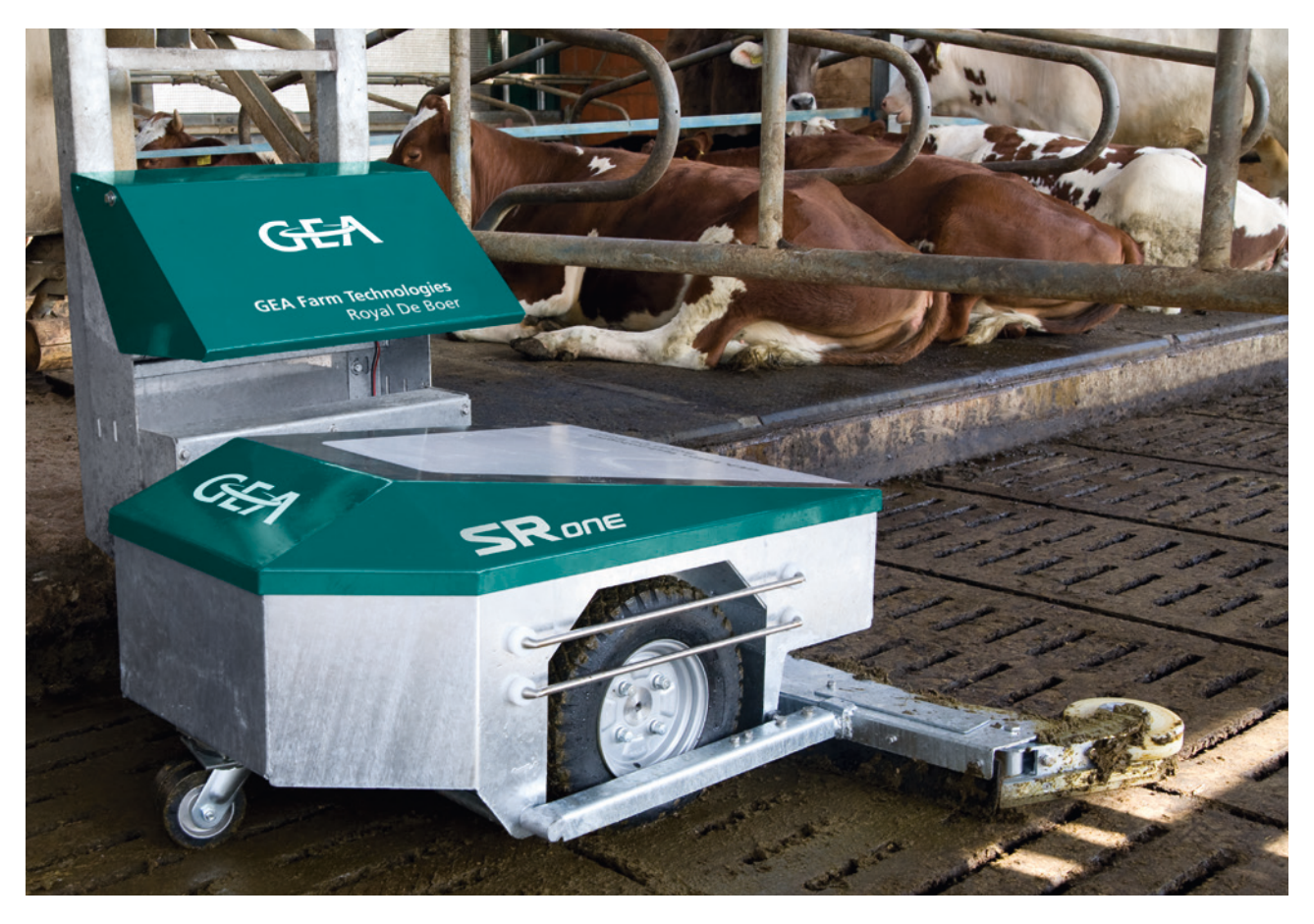
Energy management at the charging station The SRone manages its energy and charging completely independently. With a running time of up to 18 hours per day and a working speed of max. 5 m per minute, it can clean between 6,000 and 8,000 square metres of barn floor. Along fixed edges, which are installed in the barn when you buy the SRone, the slat robot cleans agilely in every corner. A minimum charge time of 6 hours, preferably overnight, completely recharges the batteries at the charging station and makes sure the SRone is ready to start on the next day.