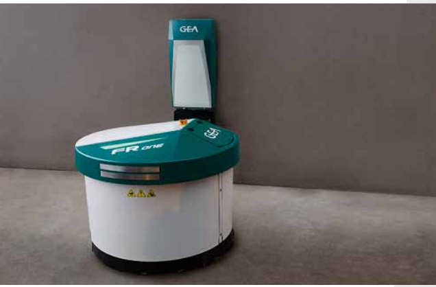
The GEA FRone returns to its charging station automatically and can leave the station either forwards or backwards.